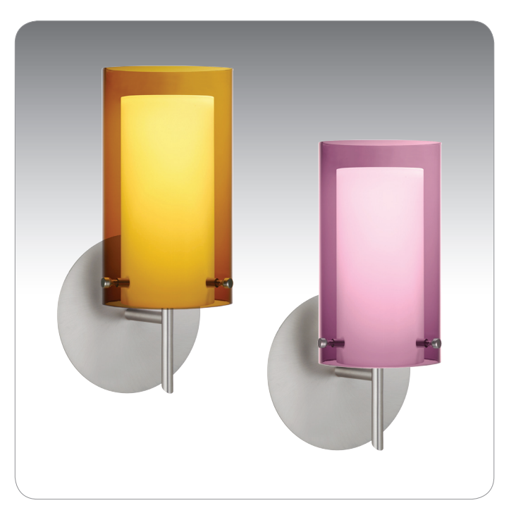
PAHU 4 SHOWN IN TRANS. ARMAGNAC/OPAL (A44007) & TRANS. GOLD/OPAL (Y44007)