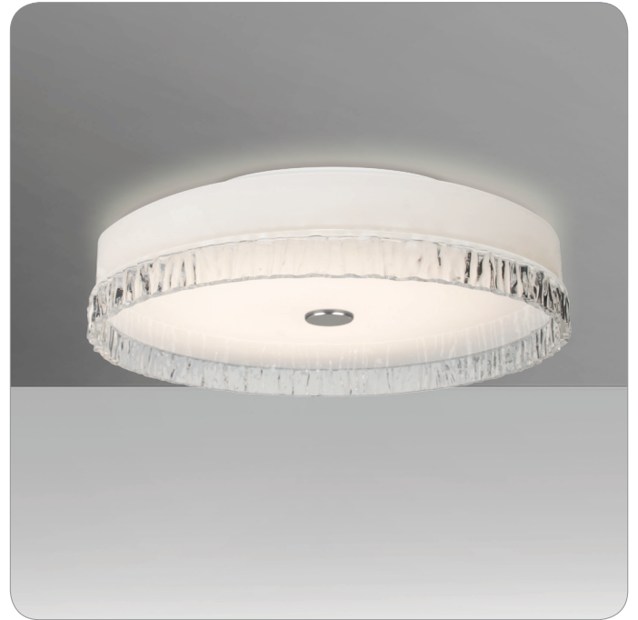
OPAL/CLEAR STONE (PACO12CLC)