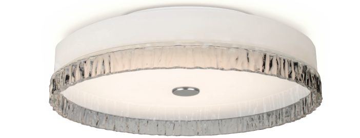
PACO12SMC OPAL/SMOKE STONE