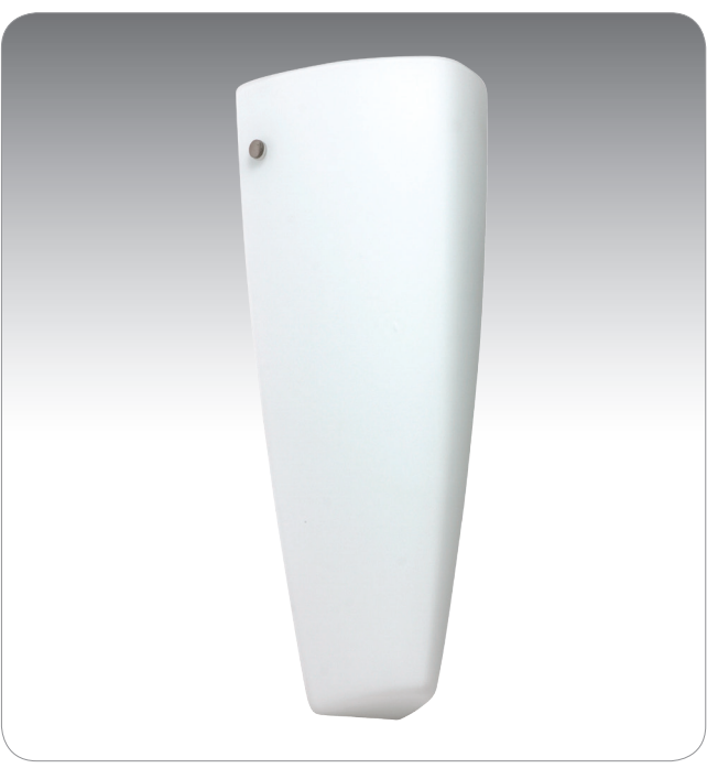
LINA SHOWN IN OPAL MATTE (708307)