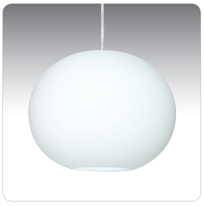
JORDO SHOWN IN OPAL MATTE (477507)