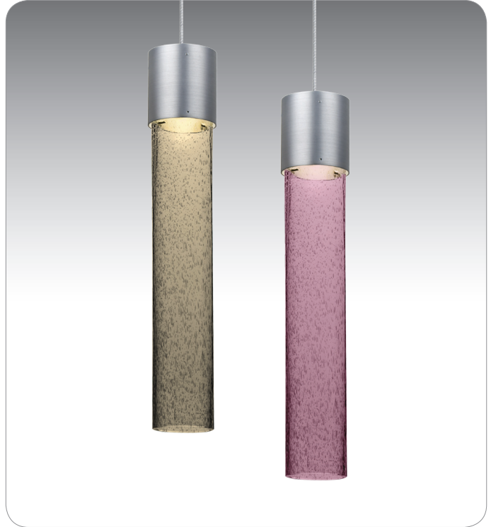
WANDA 12 SHOWN IN LATTE BUBBLE (WAND12LT) & PLUM BUBBLE (WAND12PL)

UL or ETL Listed. Suitable for Damp Locations (interior use only).