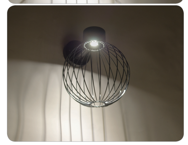
TOP TO BOTTOM: SULTANA C, F, G

All dimensions provided are nominal. Allowance must be made for dimensional tolerance in handcrafted glasses.