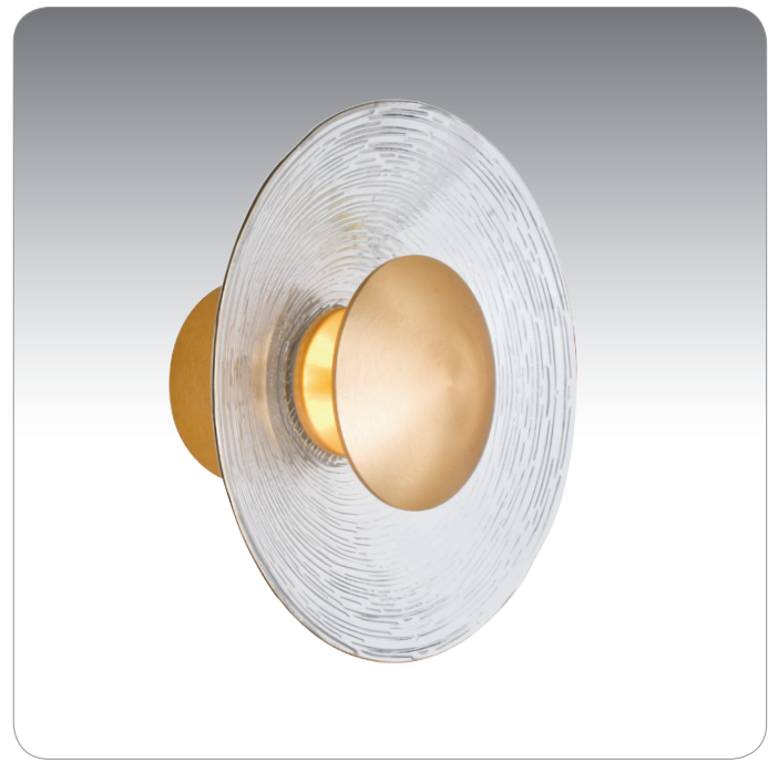
BRUSHED BRASS/CLEAR (SLYBB)