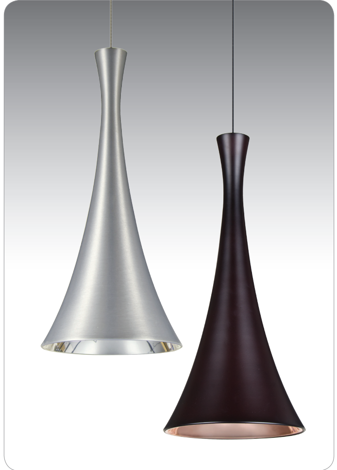
RONDO SHOWN IN SATIN NICKEL & BRONZE

UL or ETL Listed. Suitable for Damp Locations (interior use only).