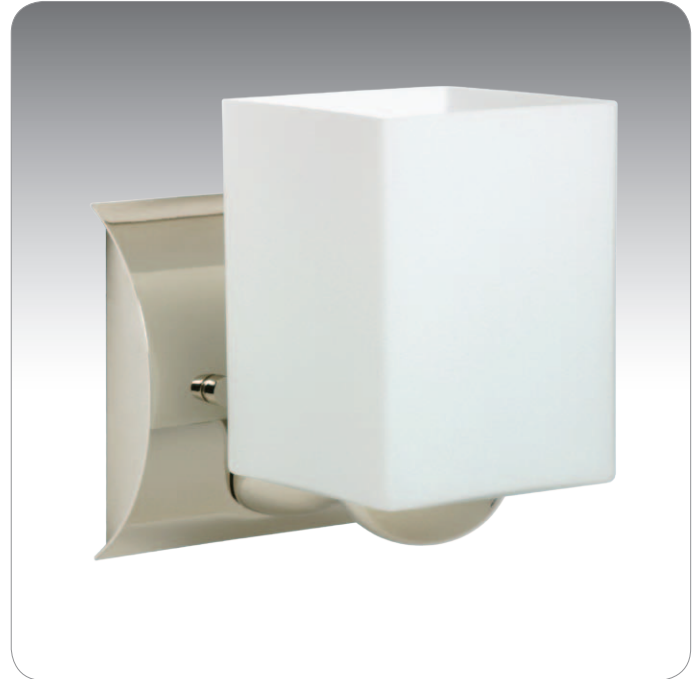
RISE SHOWN IN OPAL MATTE (449807)

UL or ETL Listed. Suitable for Damp Locations (interior use only).