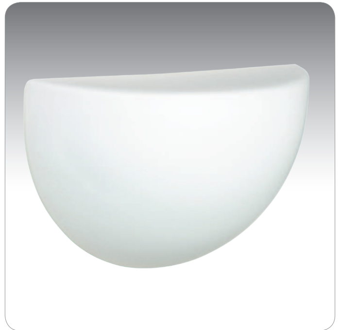
QUATRO 10 SHOWN IN OPAL MATTE (235507)

UL or ETL Listed. Suitable for Wet Locations (interior or exterior use).