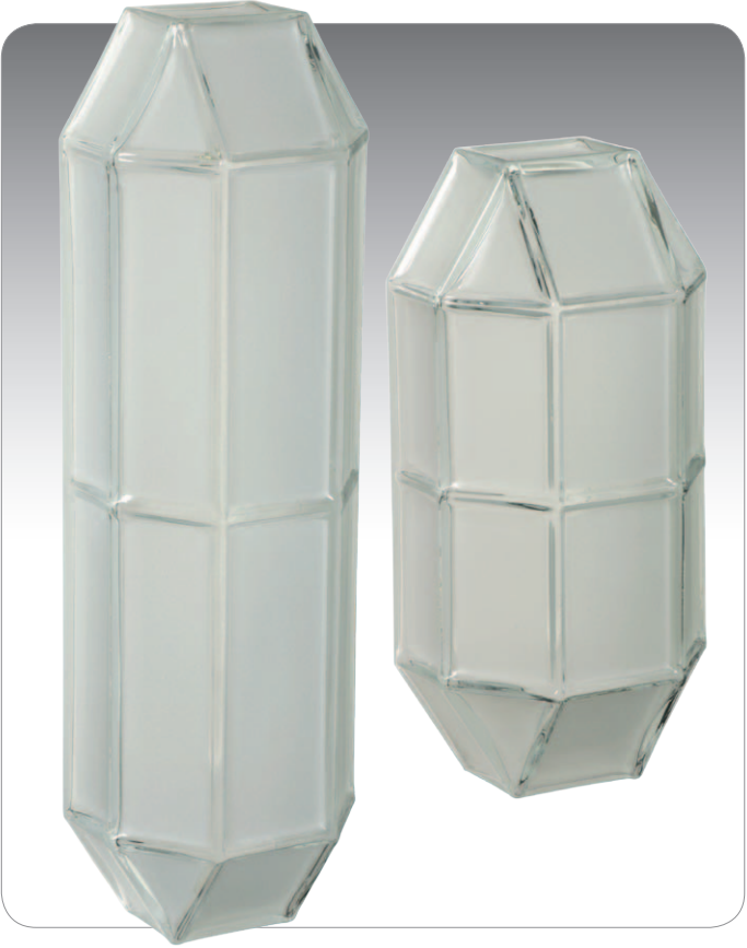
PRISMO 16 & PRISMO 10 SHOWN IN FROST/CLEAR