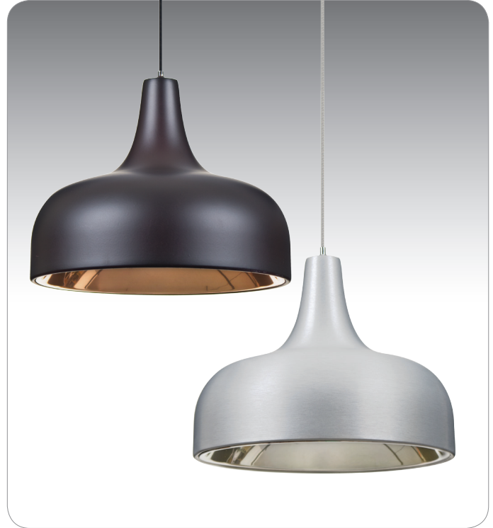
PERSIA SHOWN IN BRONZE & SATIN NICKEL

UL or ETL Listed. Suitable for Damp Locations (interior use only).