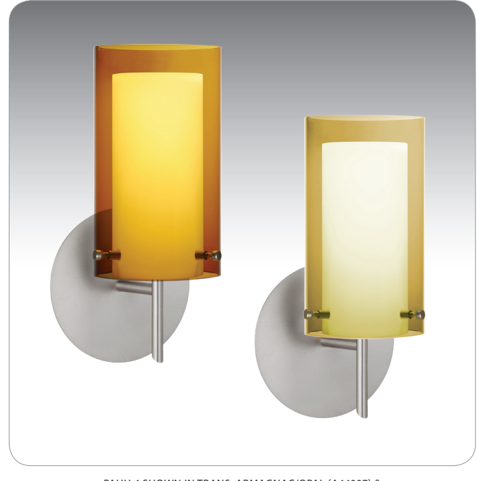
PAHU 4 SHOWN IN TRANS. ARMAGNAC/OPAL (A44007) & TRANS. GOLD/OPAL (Y44007)