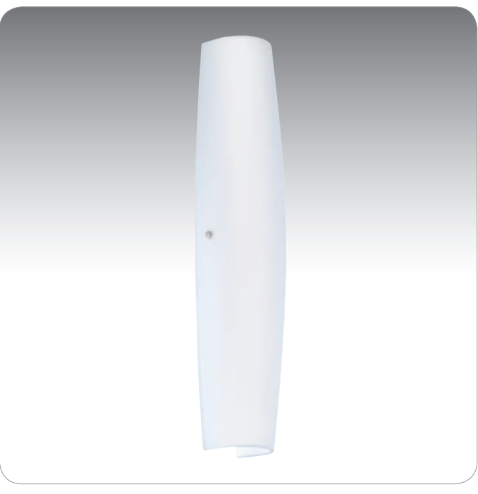
MISTRAL SHOWN IN OPAL MATTE (711207)