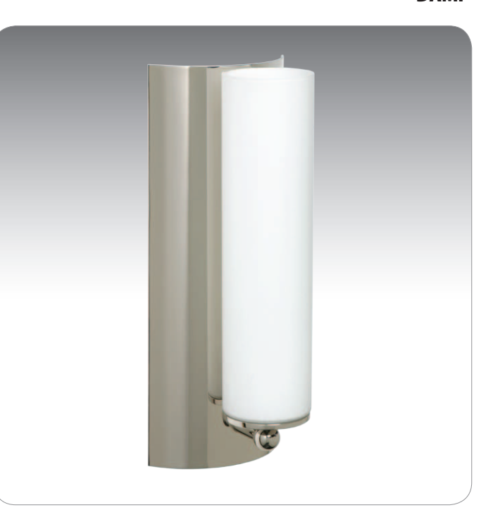
METRO SHOWN IN OPAL MATTE, POLISHED NICKEL (1WE-118607-PN)