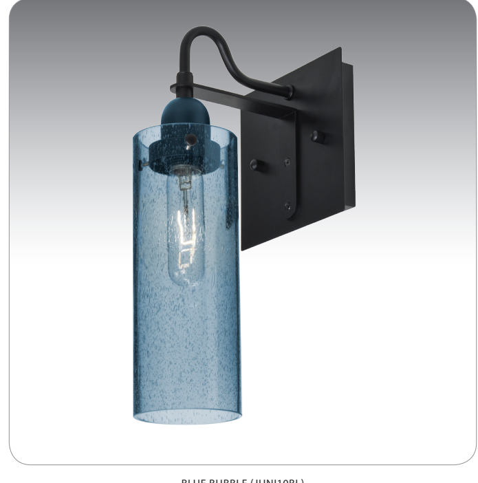
BLUE BUBBLE (JUNI10BL)