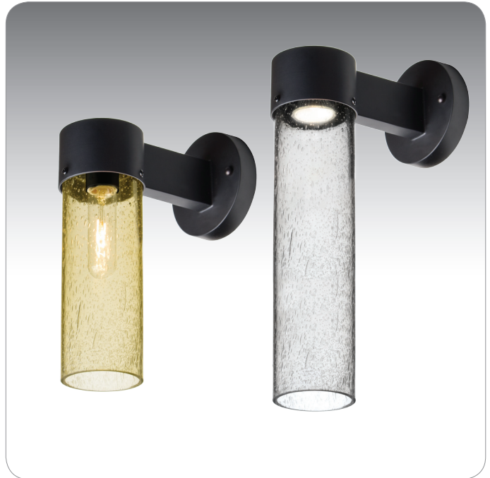
JUNI 10 SHOWN IN GOLD BUBBLE (JUNI10GD) & JUNI 16 SHOWN IN CLEAR BUBBLE (JUNI16CL) WITH LED OPTION

UL or ETL Listed. Suitable for Wet Locations (interior or exterior use).