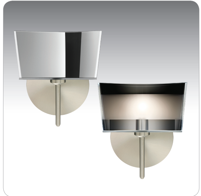
GROOVE SHOWN IN MIRROR-FROST (6773MR) SHOWN UNLIT & LIT

UL or ETL Listed. Suitable for Damp Locations (interior use only).