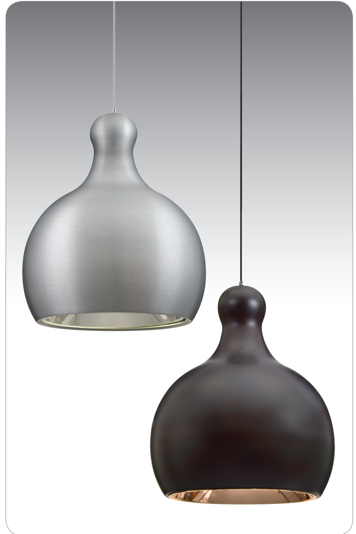
FELIX SHOWN IN SATIN NICKEL & BRONZE