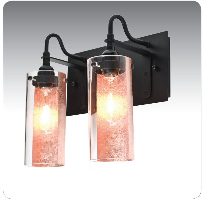
COPPER FOIL (DUKECF)

UL or ETL Listed. Suitable for Damp Locations (interior use only).