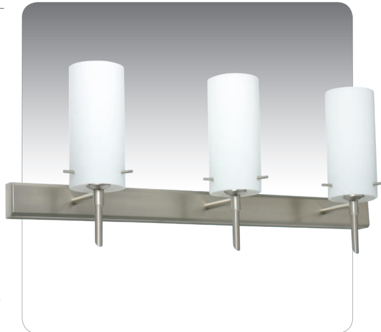
COPA 3 SHOWN IN OPAL MATTE (440307) WITH NO CANOPY

UL or ETL Listed. Suitable for Damp Locations (interior use only).