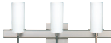
4SW: 30.375" L