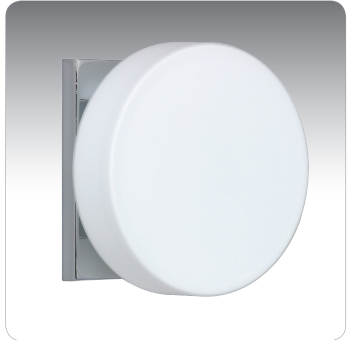
CIRO SHOWN IN OPAL MATTE (773807) IN CHROME FINISH