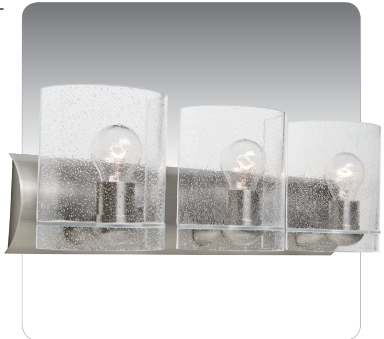
CELTIC SHOWN IN BUBBLE (CELTICBB)

UL or ETL Listed. Suitable for Damp Locations (interior use only).