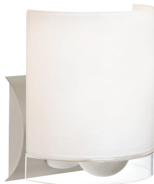
CELTICCL OPAL GLOSSY/CLEAR