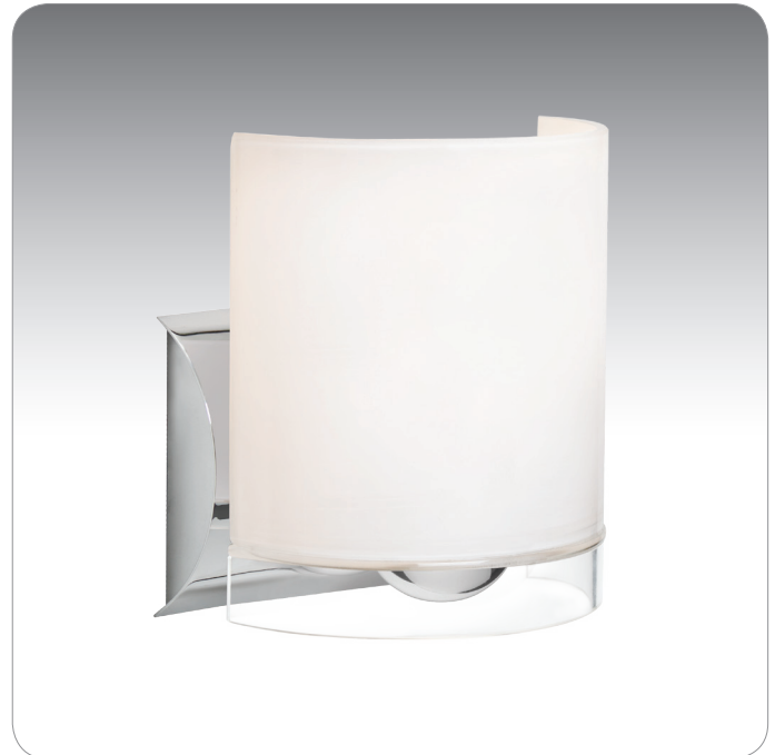
CELTIC SHOWN IN OPAL GLOSSY/CLEAR (CELTICCL) IN CHROME FINISH

UL or ETL Listed. Suitable for Damp Locations (interior use only).