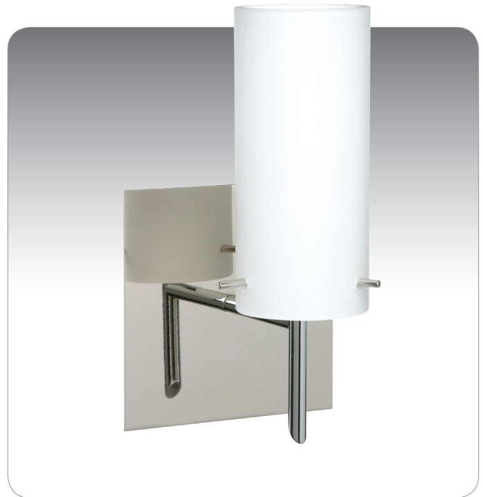
COPA 3 SHOWN IN OPAL MATTE (440307) WITH SQUARE CANOPY IN CHROME FINISH

UL or ETL Listed. Suitable for Damp Locations (interior use only).