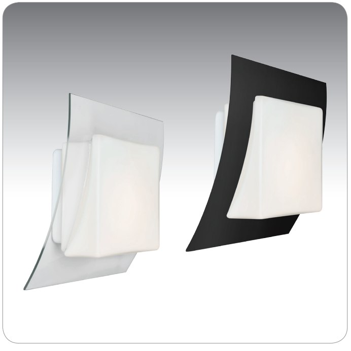
OPAL/CLEAR & OPAL/BLACK