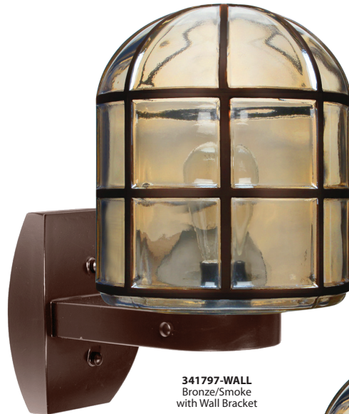
341797-WALL Bronze/Smoke with Wall Bracket

May be used in Interior or Exterior applications.