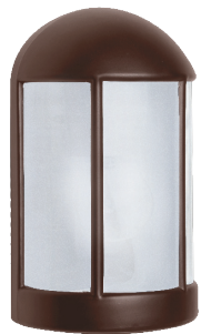
315298-FR Bronze with Frost option