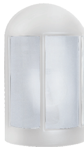
315253-FR White with Frost option