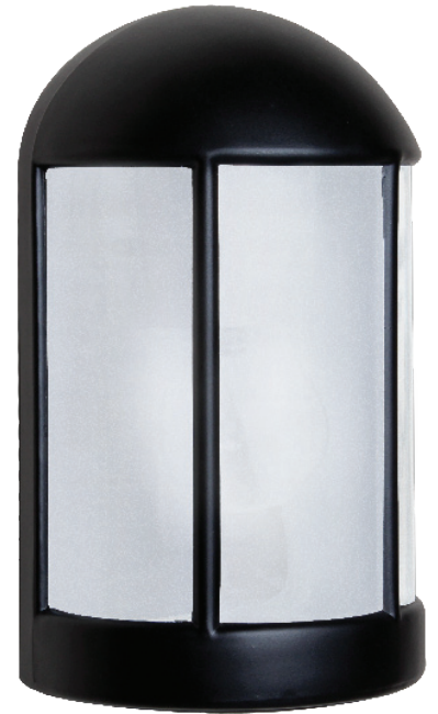
315257-FR Black with Frost option