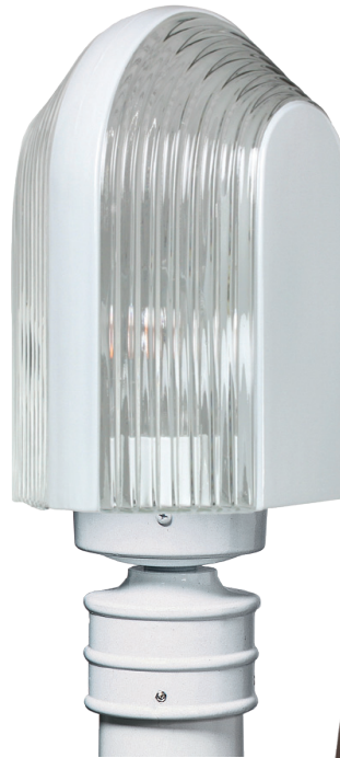
313953-POST White with Post Fitter

UL or ETL Listed. Suitable for Wet Locations. May be used in Interior or Exterior applications.