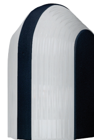
313957-FR Black with Frost option