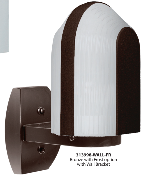
313998-WALL-FR Bronze with Frost option with Wall Bracket