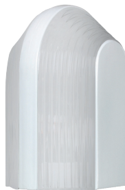
313953-FR White with Frost option