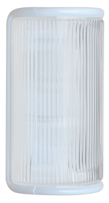
307953-FR White with Frost option