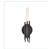
WV335409MB Matte Black

*For complete warranty terms, please visit: www.aloralighting.com/warranty