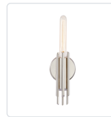
WV335409PN Polished Nickel