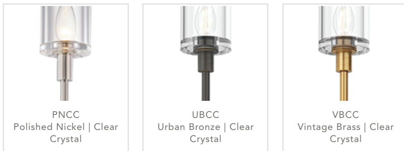
PNCC Polished Nickel | Clear Crystal