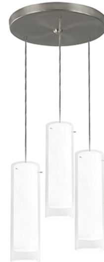
Clear Shade with White Glass

Specifications and dimensions subject to change without notice.