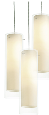
Clear Shade with Cream Glass