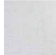
Linen White (LW)