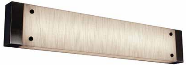
Shown in : Oil-Rubbed Bronze and Jute

Specifications and dimensions subject to change without notice.